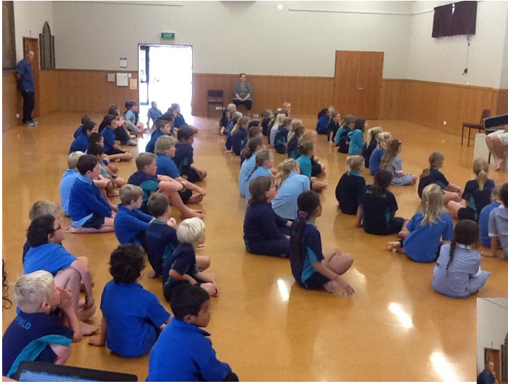
Photos from Kapa Haka today ...